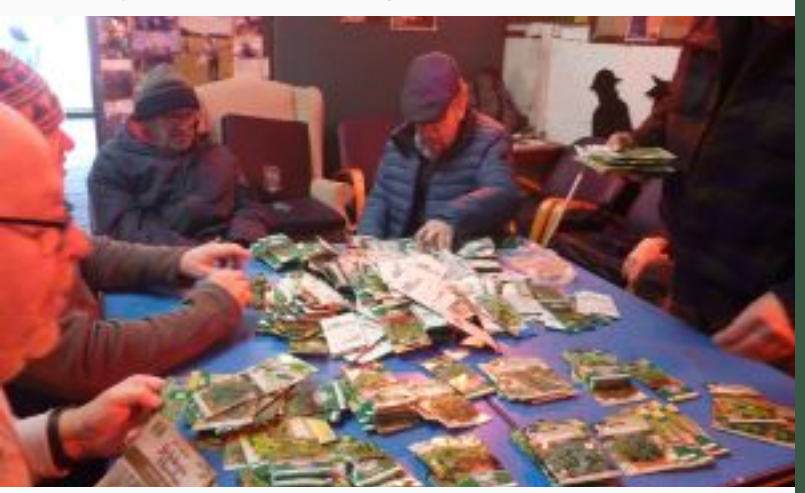
We've been given so many seeds!