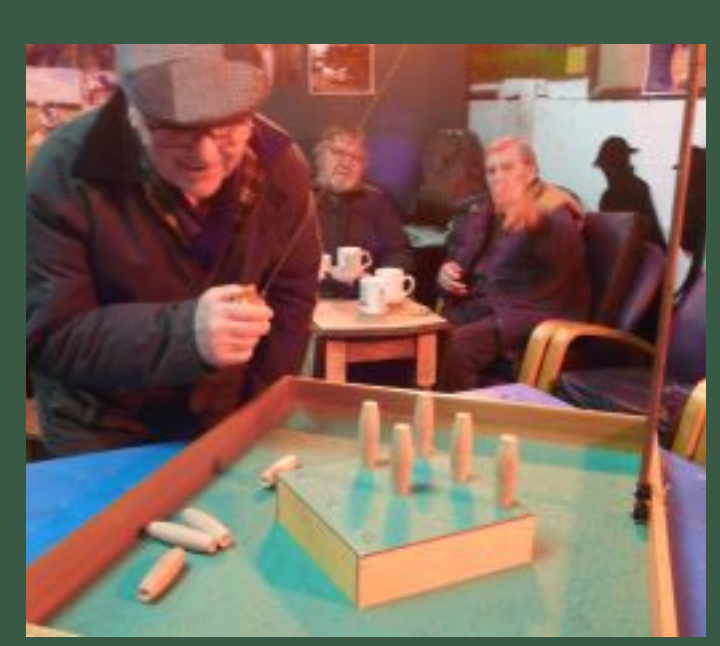
The demon knock'em downer!